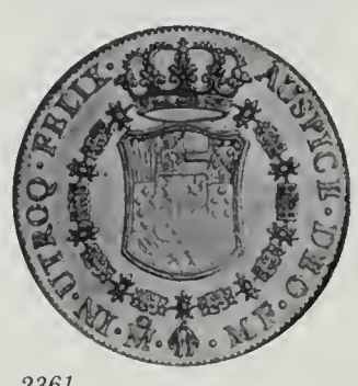
Lot No. 2361